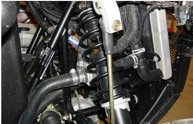
PIC09 – PASSENGER SIDE WHEEL WELL