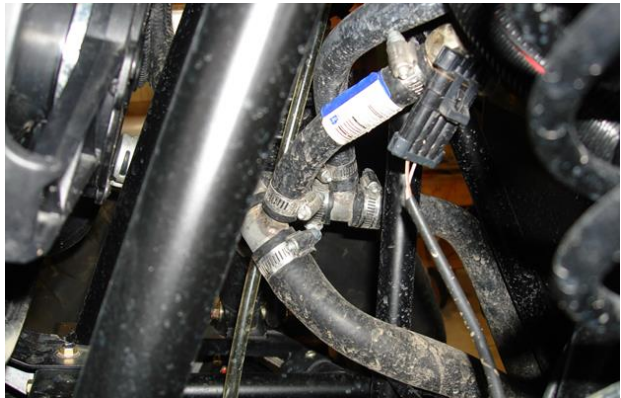
PIC10 – DRIVER SIDE WHEEL WELL